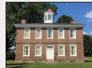
William Trent House, Trenton, NJ

Feeding the American and French armies on their rapid march across war-ravaged New Jersey was a huge logistical achievement. Towns such as Whippany had only about 30 houses and 200 inhabitants, yet 4,600 French officers and men, with their 2,000 horses and 1,800 draft oxen and beef cattle, camped and grazed on the outskirts of the little towns. Even Trenton, the largest city along the route, only had 100 houses and 500 inhabitants. Yet New Jersey rose to the challenge, and once the last troops had crossed into Pennsylvania on September 4 th , there was nothing Clinton could do to impede the march to Yorktown, VA. Six weeks later Cornwallis surrendered. The war for American independence was won.