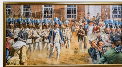
"The Brave Men Ever Fought" By Don Troiani (Museum of The American Revolution, Funded by National Park Service W3R National Historic Trail)

As the first French division left Whippany on August 29 th , the Continental Army, including the integrated Rhode Island Regiment of Native American and African American soldiers, broke camp and hurried in two columns, one via Westfield on to New Brunswick, across the Raritan