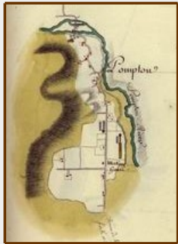
French Map of Encampment Site, Pompton, NJ

Washington and Rochambeau united their forces in July near White Plains, NY, for a possible attack on British General Sir Henry Clinton in New York City. But New York City proved too strong, and when the opportunity arose in mid-August to capture Lord Cornwallis in Virginia in cooperation with a French fleet under Admiral François Joseph Paul, Comte de Grasse, Washington quickly shifted his strategy.