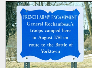
Encampment Site, Liberty Corner, NJ

French forces were not far behind. Encamped at Liberty Corner, Somerset Court House, and Princeton, the first French division troops arrived at Trenton on the evening of September 1 st .